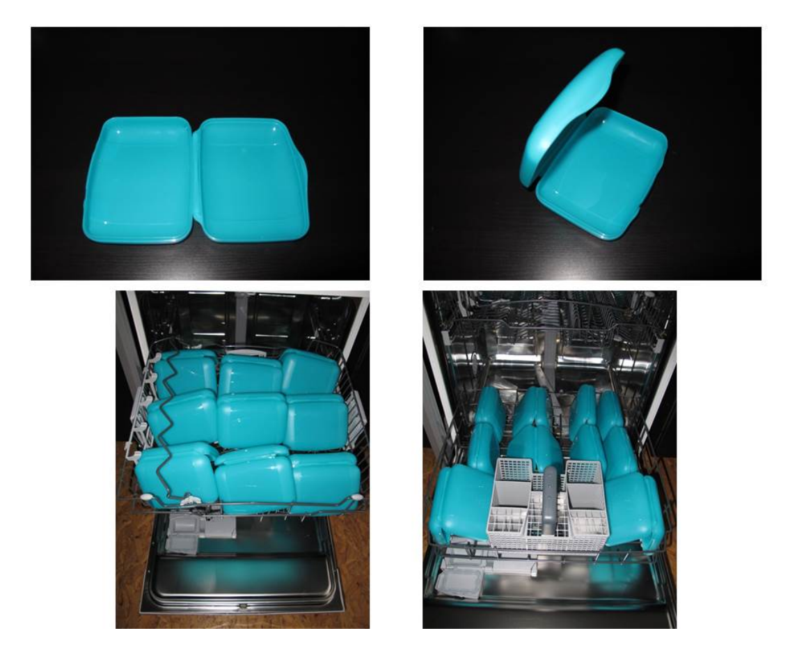
Figure 2: Plastic box and loaded dishwasher

For the alternative packaging of the same sandwich a rigid plastic box by one of the world's leading plastic box manufacturers that can be considered to be a typical sandwich box is used. Its measurements are 16 cm x 12.6 cm x 4.9 cm. The plastic box is cleaned after each use in a dishwasher. The choice of a modern dishwasher with an energy efficiency class of A+, that is only run fully loaded and in the most efficient eco-mode, can be considered as a conservative choice from the viewpoint of the aluminium foil. Calculations based on measured and manufacturer's data and loading trials show that the plastic box uses up at least 5% of the available space. Therefore 5% of the consumed energy, water and detergent per cycle are allocated to the cleaning of the rigid plastic box. The production and recycling/disposal of the plastic box are excluded from this study as it is assumed to be negligible due to the many uses of such boxes. Figure 2 shows the rigid plastic sandwich box and the fully loaded dishwasher.