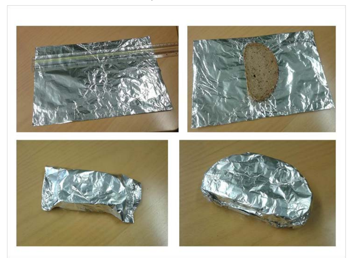
Figure 1: Household aluminium foil and sandwich

In this study two different ways to pack a sandwich are examined. A household aluminium foil packaging is compared with a reusable rigid plastic box. For the modeling of the base scenarios 1.95 g of aluminium foil (12 \mu m * 30 cm * 20 cm) is used to pack a typically sized sandwich made from two slices of bread with a filling in between. Figure 1 shows the aluminium foil used and the sandwich packed.